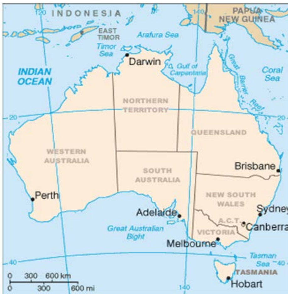
Figure 3: Australian States and Land Search Areas